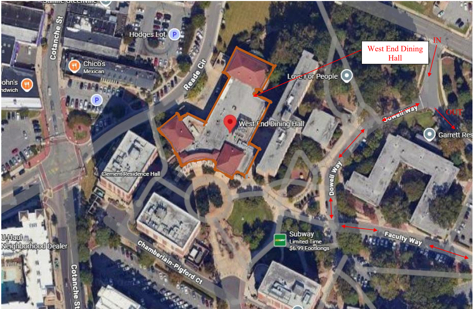
Aerial View of ECU West End Dining